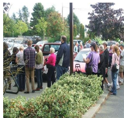
Waiting for the all-you-can-carry sale