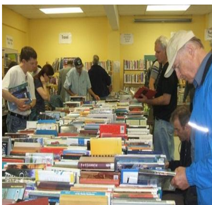
Browsing the tables